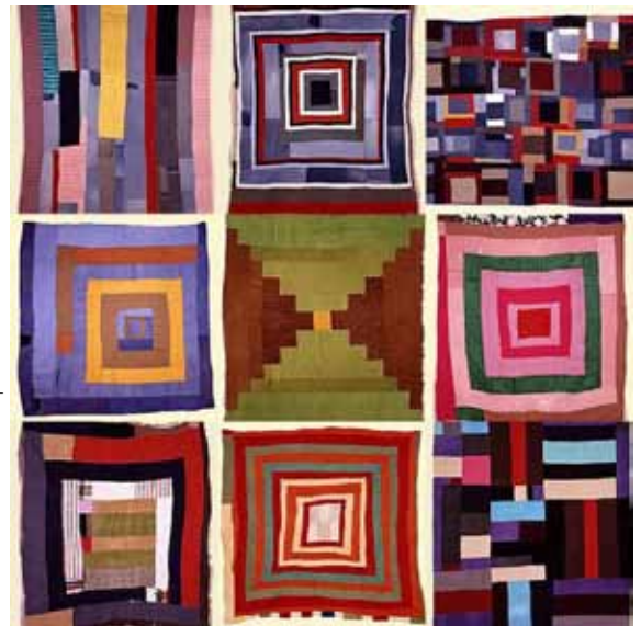
Quilts by the ladies of Gee's Bend